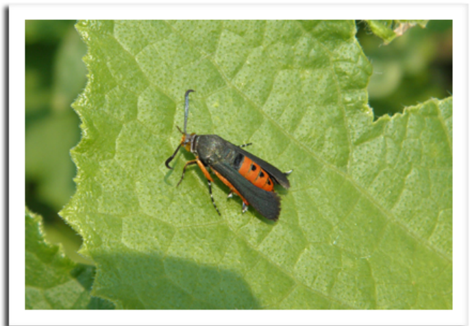
Squash vine borer moth

vent the larvae from boring into the vines. Gardeners may remove the eggs by scraping them off with a fingernail. Covering plants with row covers or netting to prevent egg deposition and placing yellow pheromone-baited sticky traps around plantings may also help to reduce problems. A conventional insecticide or kaolin clay applied to the plant bases as a weekly spray during the three- or four-week egg laying period can provide protection if the sprays thoroughly cover the plant stems and are applied repeatedly to assure good control.