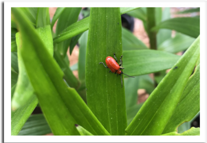
Lily leaf beetle

Taylor County on June 26. First reported in Marathon County in 2014, LLB has now been confirmed in eight Wisconsin counties. The adult beetles are bright red and conspicuous, while the larvae can be found by inspecting Asiatic lily leaves for defoliation. The leaf damage caused by LLB larvae can be significant and, without intervention, will eventually kill the plant. Recommended controls include manually removing and killing adults and larvae, scraping eggs from the undersides of leaves, or applying an insecticide labeled for use on ornamental plants.