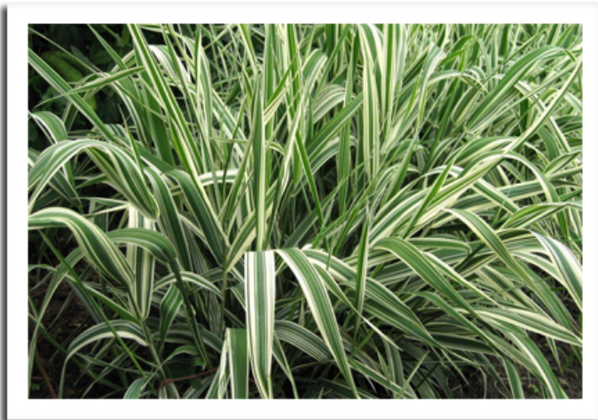
Invasive ribbon grass

Control of ribbon grass is labor-intensive and costly, often requiring sequential years of mechanical and chemical intervention (mowing, hand pulling, soil tilling, herbicide application, etc.) and burning.