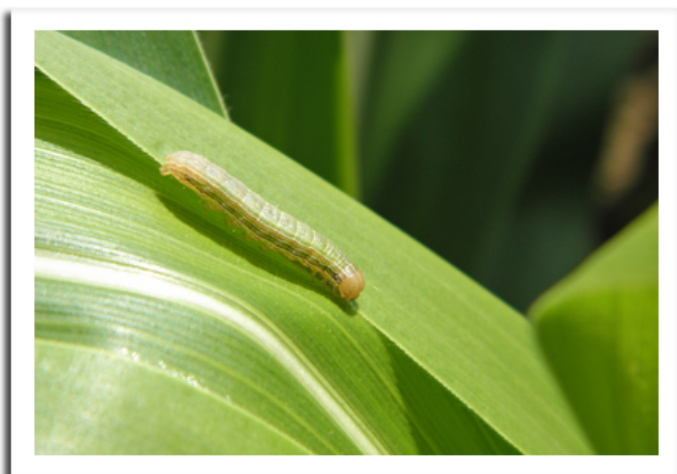
True armyworm larva

creased monitoring for first-generation armyworm larvae is particularly important at this time.