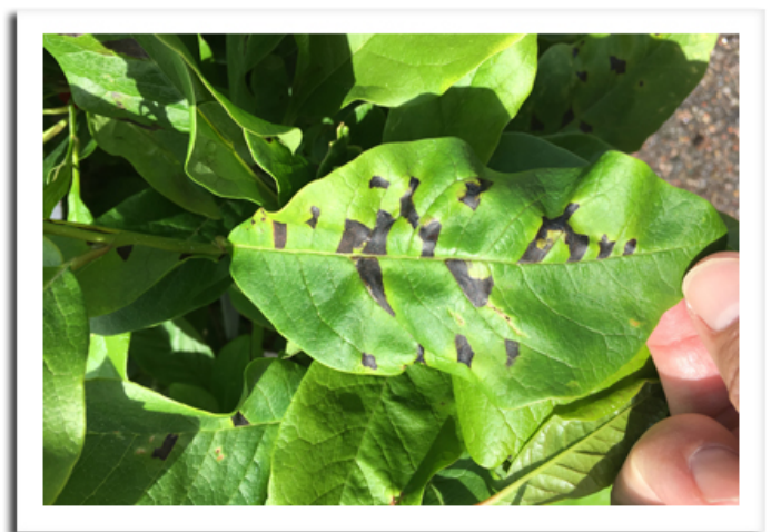
Pseudomonas leaf spot on magnolia 'Ann'

PSEUDOMONAS BACTERIAL BLIGHT: Nursery inspectors found symptoms of this bacterial disease on 'Ann' magnolia in Iron and Marathon counties. Bacterial leaf blight was previously noted on several varieties of common lilac shrubs in late May, in southern Wisconsin nurseries. Although the causal pathogen Pseudomonas syringae is named for lilac, from which it was first isolated, it has a wide host range. On magnolia, symptoms of infection appear as angular, dark brown leaf spots that may have a yellowish halo. Problems can be exacerbated by overhead watering and are usually more common in seasons with prevailing cool, wet weather.