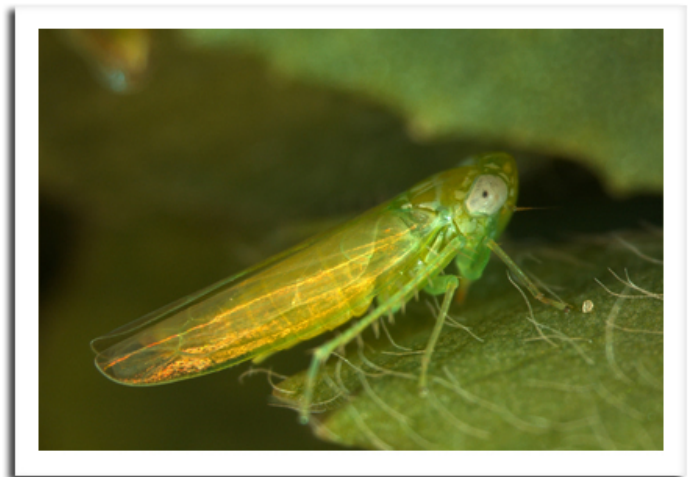
Potato leafhopper adult

POTATO LEAFHOPPER: Levels of this insect have increased abruptly in the last two weeks. Non-bearing, one- to two-year-old apple trees are most susceptible to feeding by leafhopper adults and nymphs and should be inspected for upwards leaf cupping and yellowing of terminal shoots. Treatment is justified at levels of one or more nymphs per leaf when symptoms are developing.