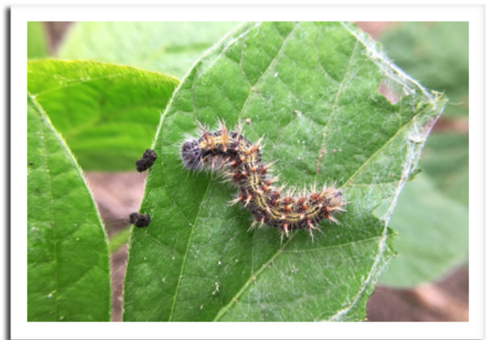
Thistle caterpillar on soybean leaf

SOYBEAN DEFOLIATORS: A variety of minor defoliators can be found at very low levels in many soybean fields. Included in this category are bean leaf beetles, green fruitworm larvae, grasshopper nymphs, obliquebanded leafrollers, rose chafers, silver-spotted skipper larvae, and thistle caterpillars, all of which were noted on fewer than 2% of plants examined in fields surveyed during the reporting period ending June 27. Prebloom soybean fields with combined defoliation rates of 30% or more may qualify for treatment, though defoliation in the vegetative stages seldom results in yield loss, especially when soil moisture, temperatures and other growing conditions are favorable. The economic threshold is lowered to 20% defoliation once soybeans reach the bloom and post-bloom stages.