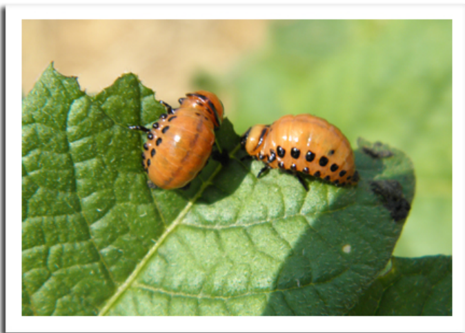
Colorado potato beetle larvae

COLORADO POTATO BEETLE: Larvae from overwintered beetles are predominantly in the early instars in southern and central Wisconsin. Controls should begin at this time, now that egg masses have hatched and while the majority of larvae are still small. Most first-generation CPB larvicide products must be reapplied 2-3 times at 7 to 10-day intervals to control populations.