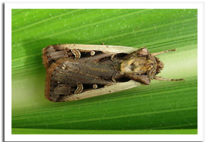
Western bean cutworm moth

WESTERN BEAN CUTWORM: Pheromone traps are now being placed at selected sites statewide in preparation for the annual moth flight. Participants in the western bean cutworm monitoring program should begin reporting counts to Tracy Schilder at tracy.schilder@wisconsin.gov no later than July 3.