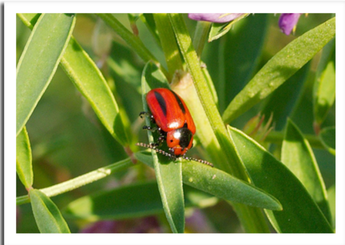
Red turnip beetle

sum and yellow rocket are thought to be the primary food plants. Small seedlings and transplants are the most susceptible to red turnip beetle feeding, while established plants can tolerate severe defoliation. Removing the adult beetles by hand is the recommended control. Beetle numbers usually decline by early to mid-July.