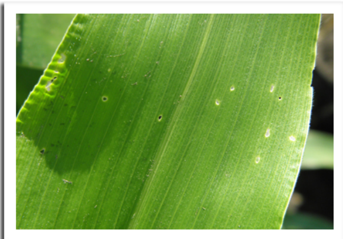
European corn borer pin hole feeding

EUROPEAN CORN BORER: The spring flight of moths has peaked in southern and central Wisconsin. Black light trap counts have been low since the flight began during the week of May 30-June 5, with weekly counts ranging no higher than 14 moths per trap. Oviposition is intensifying and shot hole feeding by first-instar ECB larvae was confirmed on June 26 in Dane County.