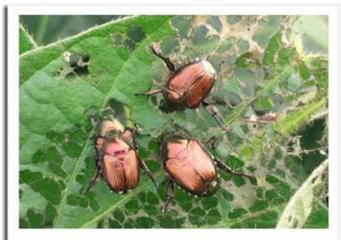
Japanese beetles feeding on soybean leaf

JAPANESE BEETLE: Adult Japanese beetles continue to cause damage to soybean field margins, with the highest counts (100-138 beetles per 100 sweeps) documented in Clark, Crawford, and Lafayette counties in the southwest and north-central districts. Average defoliation rates in fields surveyed since mid-July have varied, but have all been below the 20% threshold for soybeans in the reproductive stages, therefore treatment has generally not been warranted.