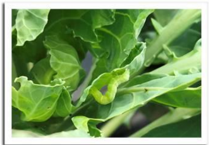
Cabbage looper caterpillar

CABBAGE LOOPER: Surveys indicate that populations of this cole crop pest are lower than last year, although growers should be aware that the second larval generation that will appear in August is usually more damaging than the first generation. The predominant development stages noted in gardens and on CSA farms in the past two weeks were full-grown larvae and adult moths. From early heading until harvest, the UW recommends control to maintain marketability if 10% of plants are infested.