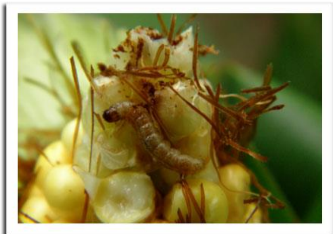
European corn borer third instar larva

Beloit 1,822, La Crosse 1,757, Madison 1,778, and Eau Claire 1,750.