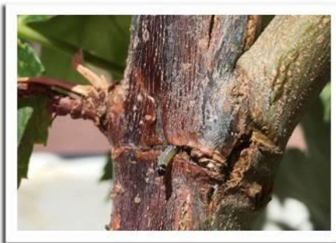
Maple callus borer larva in Autumn Blaze maple Timothy Allen DATCP

callus tissue surrounding healing wounds. Larval feeding may cause wounds to enlarge if larval numbers are high, or prevent small wounds from healing. In addition, trees may be reinfested in subsequent years, leading to reduced vigor and increased susceptibility to attack from other damaging pests.