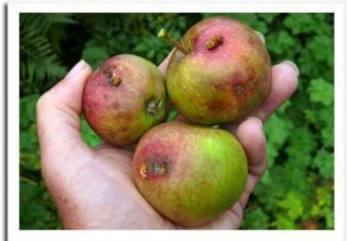
Codling moth larval damage to apples

pressure is often a direct indicator the efficacy of spring generation management programs.