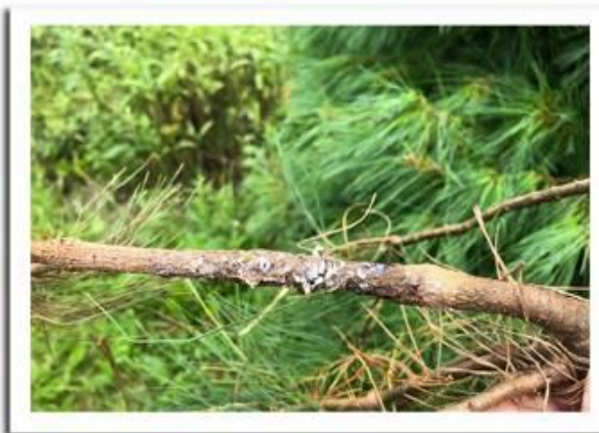
White pine blister rust shoot symptoms

WHITE PINE BLISTER RUST: Nursery inspectors recommend scouting white pine fields during the growing season for brown shoots and other signs of white pine blister rust (WPBR) infection. Trees with off-colored or brown shoots should be checked on the interior stem for developing symptoms of WPBR, such as swollen discolored stems with rust pustules emerging from the bark. Cutting off the branch close to the trunk and promptly disposing of the infected material can limit the movement of this fungus into the trunk and prevent it from girdling the tree. The alternate host plants for WPBR are in the Ribes genus (gooseberry and currant).