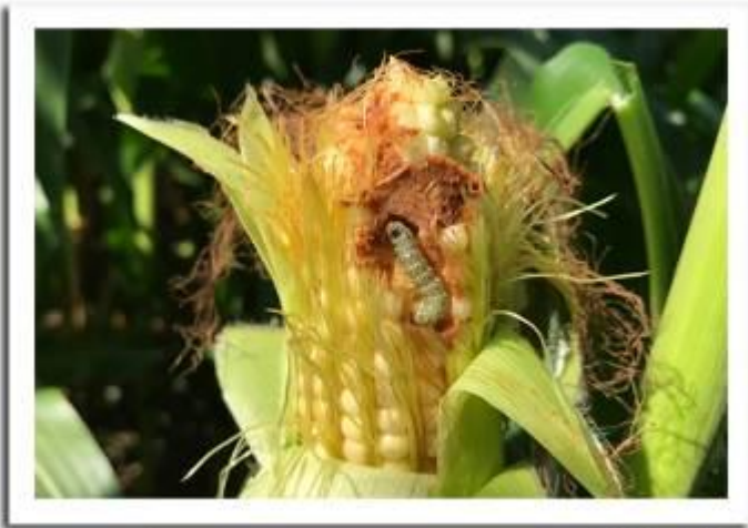
Corn earworm larva

moths for three consecutive nights) signals that sweet corn producers should increase monitoring of fields with green silks.