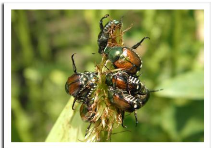
Japanese beetles feeding on corn silks Krista Hamilton DATCP

JAPANESE BEETLE: Silk pruning has become evident along field edges, although at most sites the heaviest feeding is limited to the outer rows and the infestations do not extend more than 5-6 rows into the field interior. Control of this pest in corn is warranted if populations exceed three beetles per ear and pollination is less than 50% complete. Chemical treatment of entire fields is rarely necessary. Border area spot treatments are usually sufficient for reducing beetles during the critical pollination period.