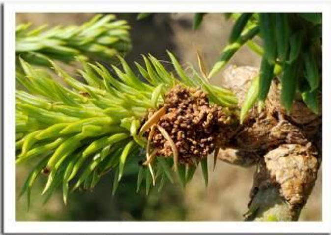
Fir coneworm feeding site

FIR CONEWORM: Damage to terminals of young plant stock and recently transplanted Fraser and balsam fir trees were observed in Grant and Portage counties. Although more often found feeding in cones, fir coneworm caterpillars can also bore into the center of terminal leaders, from the tip to the first whorl of branches, causing branch death. Terminal feeding in fir is usually noticed once it's too late for treatment. Frass and light webbing are common at the site where first-instar caterpillars entered the cone or terminal to feed. The caterpillars continue to feed until reaching the final instar, at which point they drop to the soil and overwinter in the pre-pupal stage.