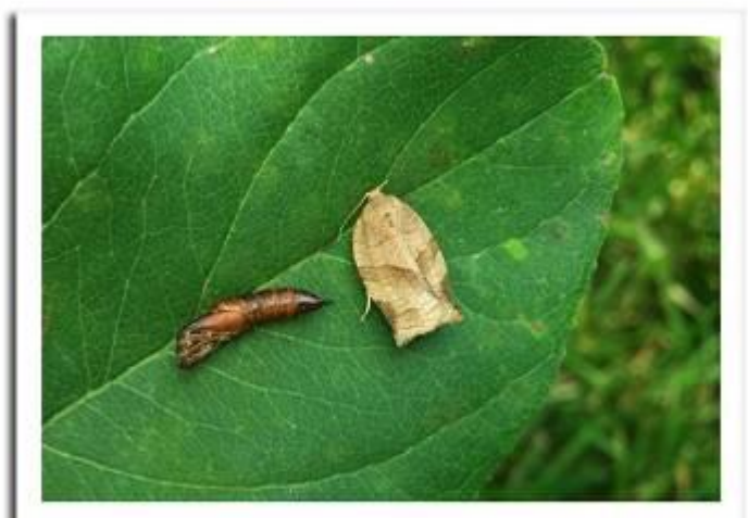
Obliquebanded leafroller moth and pupa

OBLIQUEBANDED LEAFROLLER: Moths of the second flight are appearing in low numbers in pheromone traps. The summer flight is underway and will likely continue until early September this year, in which case surface feeding damage would also persist into fall. OBLR larvae have been prevalent in soybeans and other field crops this season.