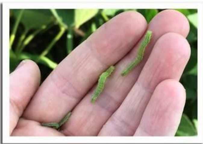
Green cloverworm larvae

GREEN CLOVERWORM: Larvae of all sizes are common in soybeans, particularly in fields from the southwestern area of the state. This week's highest count of 13 caterpillars per 100 sweeps was found in Grant County. The majority of larvae observed were newly hatched and still relatively small, suggesting that feeding injury will likely intensify by mid-August. Based on recent survey observations, populations and defoliation could be locally high next month.