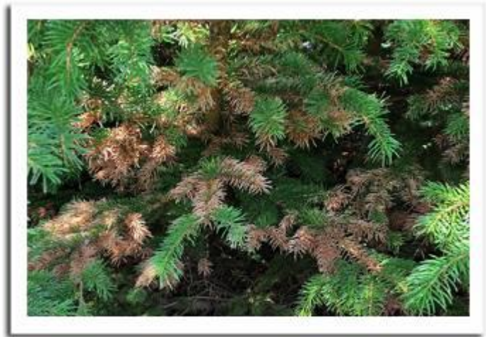
Lirula needlecast on Black Hills spruce

grass growing under and into trees. New needle growth should be protected from infection with treatment of a registered fungicide multiple times in the spring and again in July for at least two years. Prevention is easier; growing spruce on higher ground with enough spacing and weed control to keep the needles dry is a best practice. Even spruce planted in wind rows can develop this disease and grow to look and perform poorly. Spruce trees require air movement around all sides of the tree.