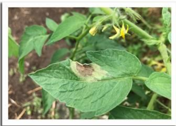
Late blight lesion on tomato leaf

LATE BLIGHT: No cases of late blight have been detected in any Wisconsin potato field or home garden as of July 29. However, the UW is reporting that all potato growing areas in the state have reached the threshold for late blight development, therefore gardeners are advised to continue inspecting tomato and potato plants for leaf lesions and fruit spots. Growers who suspect late blight are encouraged to send symptomatic plant material to the UW Plant Disease Diagnostic Clinic: https://pddc.wisc.edu/sample-collection-and-submission/ . Late blight testing is free of charge.