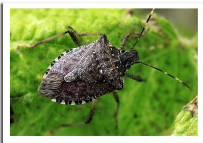
Brown marmorated stink bug

As BMSB populations continue to increase and spread in Wisconsin, on-site monitoring will be the best determinant of whether or control is necessary. An economic threshold for clear sticky panel traps is not yet available. However, USDA-ARS Research Entomologist Dr. Tracy Leskey has specified a provisional threshold of 10 BMSB per week for black pyramid traps to apply an alternate-row-middle spray, noting that the occasional BMSB caught in traps may not warrant BMSB sprays and growers should wait for sustained captures.