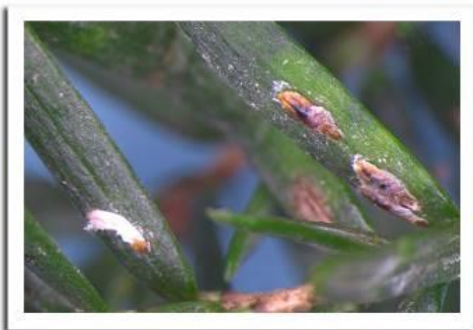
Coniferous Fiorinia scale on hemlock

Similar to Cryptomeria and elongate hemlock scale that were also found on hemlock nursery stock, the Fiorinia scale has the potential to damage native Wisconsin evergreens, including firs, pines, spruces, hemlock, junipers (including red cedar), and Canadian yew. Unlike the other armored scales that feed only on needle undersides, Fiorinia feeds on both the upper and lower needle surfaces. Damage from this new scale is likely to include yellowing of needles, needle loss, and reduced tree vigor, which can exacerbate other health issues or predispose plants to secondary pest problems.