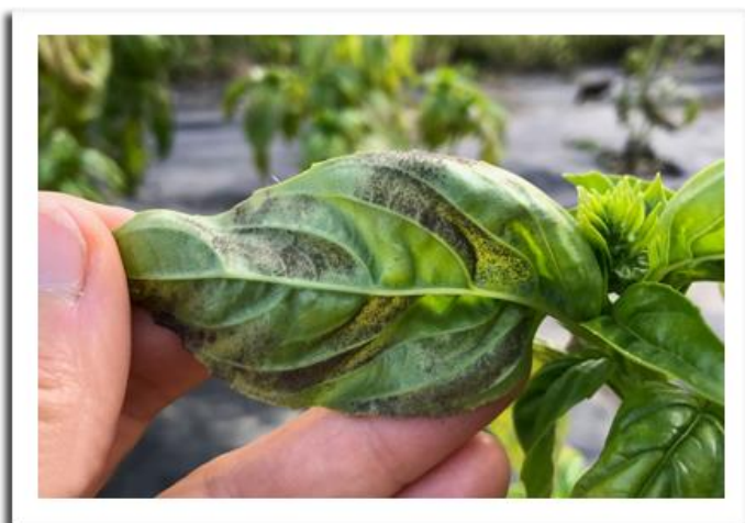
Basil downy mildew

ing in early August. Last year, the first basil downy mildew (BDM) cases of the season were confirmed by mid-July. If basil downy mildew is suspected, harvesting early may be the best option for avoiding total crop loss. Plants that are already showing noticeable BDM symptoms, such as yellowing leaves and gray downy growth on the lower leaf surface, should be immediately removed and disposed of off-site.