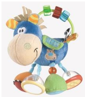
Playgro Recalls Infant Activity Rattles Due to Choking Hazard | CPSC.gov

What to do: Consumers should immediately take the recalled rattles away from children, stop using them and contact Playgro for a free replacement, including shipping. Consumers can contact Playgro toll-free at 855-775-2947 from 8 a.m. to 4:30 p.m. PT Monday through Friday, email at customercare@playgro.com , or online at https://us.playgro.com/ and click on the Safety Recall link located at the top of the page or https://form.jotform.com/vgadmin/PlaygroRecall to register on-line for a free replacement or for more information.