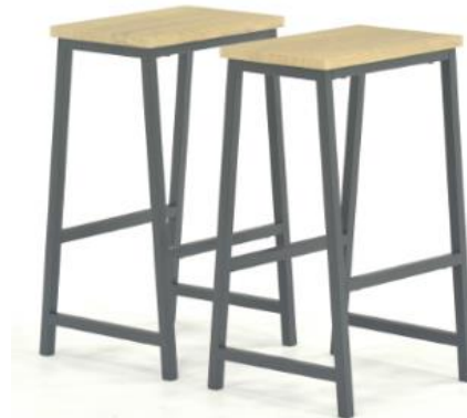
Sauder Woodworking Recalls Counter Height Bar Stools Due to Fall Hazard | CPSC.gov

What to do: Consumers should immediately stop using the recalled bar stools and contact Sauder Woodworking to receive a full refund for each two-piece stool set. Sauder Woodworking is contacting all known purchasers directly. Consumers can contact Sauder Woodworking toll-free at 866-218-8312 from 9 a.m. to 5:30 p.m. ET Monday through Friday or online at www.sauder.com and click on "About" and then "Public Notices" for more information.