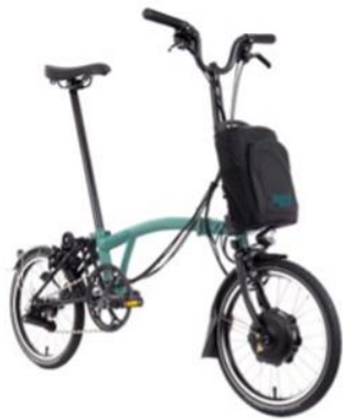
Brompton Bicycle Recalls Electric Folding Bicycles Due to Fall and Injury Hazards | CPSC.gov

What to do: Consumers should stop using the recalled bicycles immediately and contact the nearest authorized Brompton Electric dealer for a free software upgrade to Version 1-2-10-2. Consumers can contact Brompton Bicycle at 800-578-6785 from 10 a.m. to 5 p.m. ET Monday through Friday, email at Support@Brompton.com , online at https://us.brompton.com/recall or https://us.brompton.com/ and click Brompton Electric Recall Notice for more information.