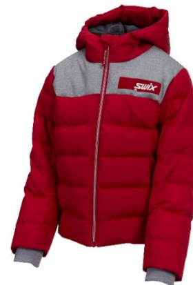
BRAV USA Recalls Youth Jackets with Drawstrings Due to Strangulation and Entrapment Hazards | CPSC.gov

What to do: Consumers should immediately take the recalled jacket away from children and remove the drawstrings to eliminate the hazard, or return the jacket to BRAV USA for a full refund, shipping included. Consumers can contact BRAV USA at 800-343-8335 from 10 a.m. to 4 p.m. ET Monday through Friday, email bravrecall.usa@brav.com or online at http://swixsport.com and click on "Recall Information" at the bottom of the page for instructions on how to remove the drawstrings from the jackets or to receive a full refund.