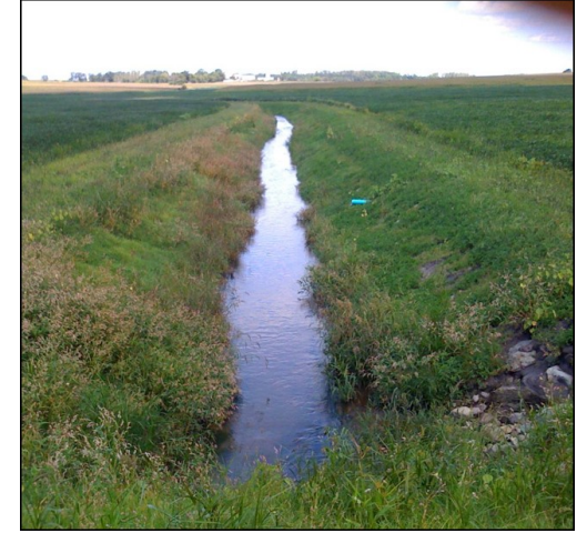
Agricultural drainage lowers the water table to make land more suitable for farming.