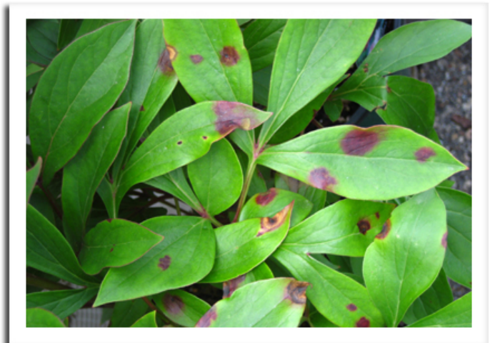
Red spot on peony

PEONY RED SPOT: Peonies at nursery stock retailers in Richland County were infected with this fungal disease, characterized by small, circular, reddish or purplish leaf spots that appear on the upper surfaces of young leaves shortly before bloom. Later in the season the lesions expand and merge to form large, irregular blighted areas. All above-ground parts of the peony are susceptible to red spot. This disease is an aesthetic problem that can be controlled by cutting back plants to ground level in fall and destroying infected foliage. Fungicides labeled for peony red spot also provide red spot control and should be applied to the soil around plants in spring when new shoots are 2-4 inches tall. A second post-emergence application may be necessary.