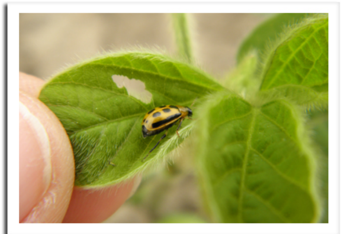
Bean leaf beetle

threat of defoliation to the earliest emerging soybeans, beetle populations are forecasted to be moderate or high this spring following an unusually mild winter. The estimated 33% of soybean acres that have been planted as of May 18 are at increased risk of infestation by overwintered adults and should be checked for evidence of beetle feeding.