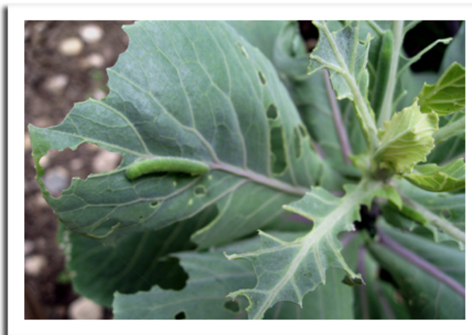
Imported cabbageworm larva

IMPORTED CABBAGEWORM: Larvae are emerging in advanced southern and western areas of the state. Cabbageworms chew large, irregular holes in leaves, bore into heads, and drop brown fecal pellets that contaminate the marketed product. Cole crops can tolerate considerable defoliation at the thinning or transplanting stages, but frequent sampling is recommended to assess populations. The biological insecticide, Bacillus thuringiensis (Bt), is effective against early-instar caterpillars and is an OMRI-approved control for infestations affecting 30% or more of plants during the transplant to cupping stages. Treatments should be carefully targeted to avoid disrupting natural enemies.