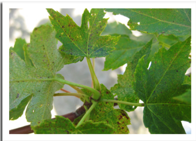
Spider mite damage on maple

MITES: Mandevillas at a garden center in Manitowoc County were exhibiting damage attributed to mites. Symptoms of mite infestation vary by mite species and host plant, but usually include stippling, bronzing, mottling and chlorosis of leaves. The species most commonly found in greenhouse settings are the two-spotted spider mite and the cyclamen mite. Successful control of mites requires accurate identification of the species involved.