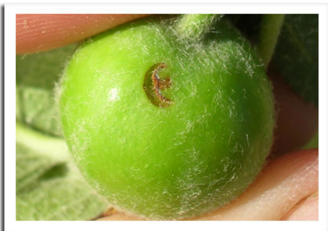
Plum curculio crescent-shaped oviposition scar

less advanced. Female weevils show a strong preference for early-sizing apples and fruitlets beyond 10 mm will be most attractive. Organic control options include PyGanic (pyrethrin) applied at dusk to the outer rows and Surround WP (kaolin) on the interior trees. Both materials should be applied on a warm evening since most oviposition occurs at night.