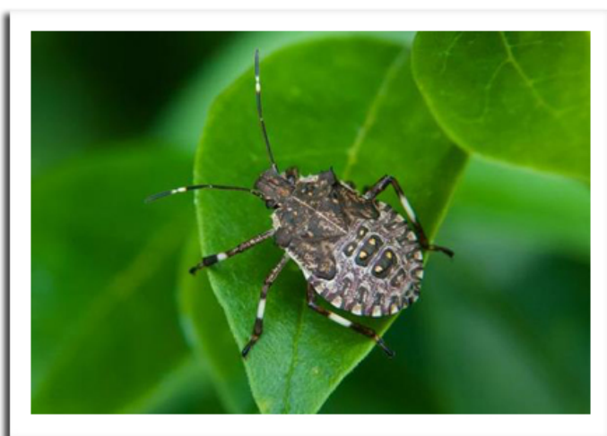
Brown marmorated stink bug nymph

BROWN MARMORATED STINK BUG: Nymphs were observed by a DATCP field specialist on July 27 near Green Bay, in a raspberry planting. This invasive insect has previously been confirmed as occurring in Brown County and in parts of the east-central region, though it has never been found or reported in a fruit crop in that area of the state. The appearance of juvenile stink bugs is evidence of established, reproducing populations in Brown County and suggests that eastern Wisconsin fruit growers should increase scouting for BMSB this month.