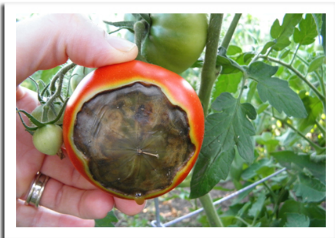
Blossom end rot on tomato

ture levels throughout the season usually reduces the occurrence of blossom end rot.