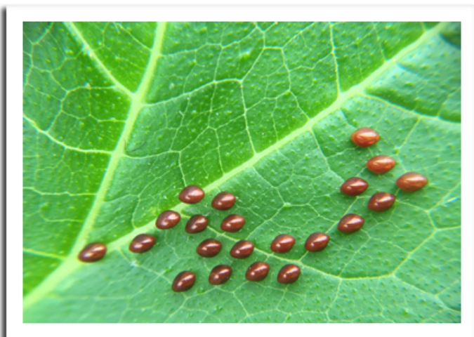
Squash bug eggs

SQUASH BUG: Adult and nymphs are very active in pumpkin and winter squash plantings across the state. Vegetable growers should continue to inspect the undersides of leaves for the metallic bronze eggs, deposited in groups of 15-40 between leaf veins or on stems, as long as small nymphs are present. Squash bugs are capable of damaging mature fruit, thus control may be needed as the crop nears harvest. OMRI-listed materials include PyGanic, insecticidal soaps and certain oils.