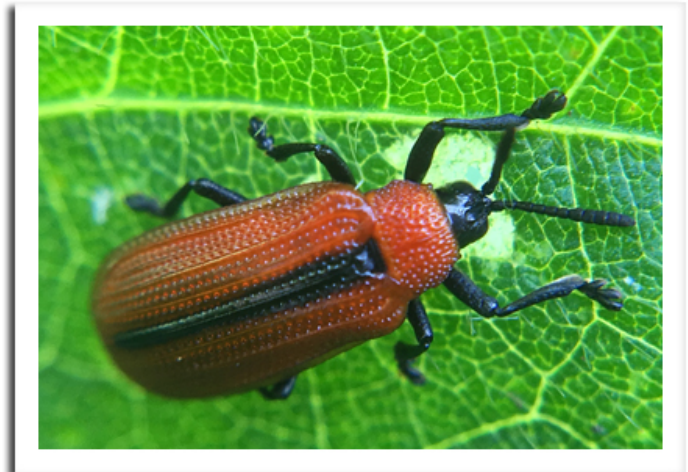
Soybean leafminer beetle

SOYBEAN LEAFMINER: This red and black leafmining beetle was collected by a DATCP specialist from La Crosse County soybeans on August 1. Soybean leafminer has not previously been documented on soybeans in the state. UW-Madison Insect Research Collection (IRC) records show that the insect has been found in five other Wisconsin counties since 1975, including: Dane, Grant, Rock, Sauk and Waukesha. The species feeds on various legumes and most of the 15 IRC records were from tick trefoil. It is not known to cause economic soybean damage, though the beetles can transmit bean pod mottle virus and contribute to the spread of this pathogen in soybean fields.