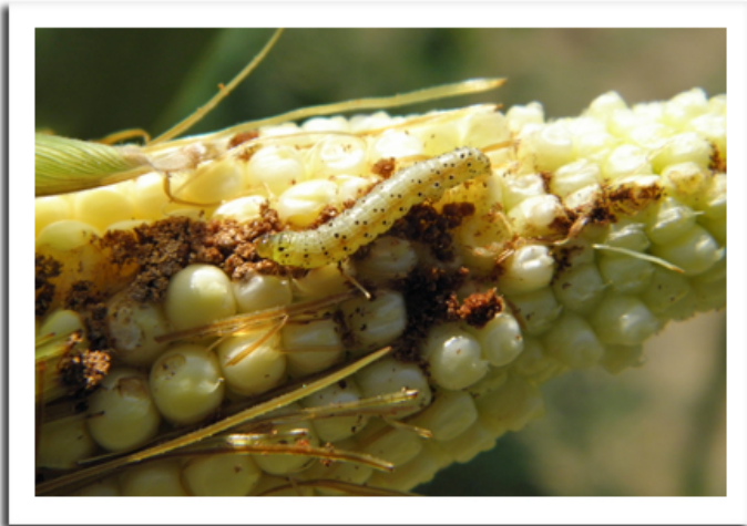
Corn earworm larva

CORN EARWORM: Counts remained low during the past week. Thirty-eight moths were registered at 15 pheromone trap sites, compared to 24 moths captured the previous week. Despite the low numbers, the arrival of even a few moths in traps signals that sweet corn producers should begin monitoring fields with green silks. Small larvae were observed this week in corn ears in a field near Tomah in Monroe County.