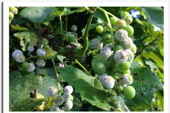
Downy mildew on grapes

DOWNY MILDEW: This common fungal problem was confirmed on 'Valiant' grapes from Iron County earlier this week. Downy mildew is characterized by whitish mold that develops on the grape leaf undersides, stems, and on fruits. Upper leaf surfaces may show yellowing opposite the moldy leaf undersides. Mildew occurrence can be minimized by reducing humidity and improving air circulation. The fungus overwinters as spores on old leaves or as mycelium in bud tissue, so thorough end-of-season sanitation is important where mildew infection has been severe in 2017.