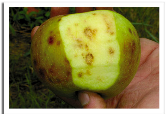
Brown marmorated stink bug damage

STINK BUG: Populations of native stink bugs are increasing in field crops, indicating a potential for movement into apple orchards prior to harvest. Orchard sites adjacent to uncultivated areas or with ground covers provide favored habitat. Apple growers should begin scouting fruits for the dimples or dark, irregular circular depressions typical of stink bug feeding, and flag sites with multiple depressions on the same fruit or tree. Damage by this pest is often limited to perimeter areas in the orchard and depending on the distribution of the population, spot treatment may be adequate.