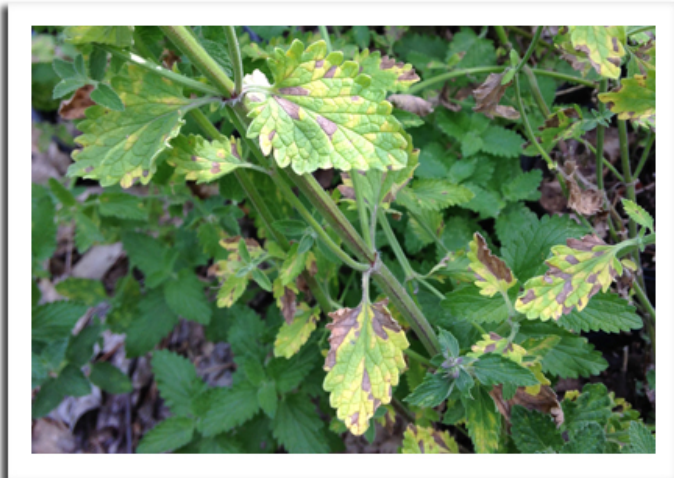
Nepeta damaged by foliar nematode

since the nematodes can temporarily survive in soil. Cuttings from infected stock should never be used for propagation, and decontamination of tools following contact with plants suspected of being infected is good practice. Chemical control is not effective against this pest.