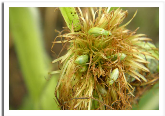
Northern corn rootworm beetles feeding on corn silks

CORN ROOTWORM: Corn surveyed in the southern and central districts yielded variable averages of 0-2.9 beetles per plant, with the week's highest population recorded near Lancaster in Grant County. Economic averages of 0.75 or more beetles per plant were found in only 7 of 78 fields sampled from July 31-August 2. Counts at most sites are still fairly low for early August. The 2017 beetle survey is now in progress and will continue for the next 2-3 weeks.