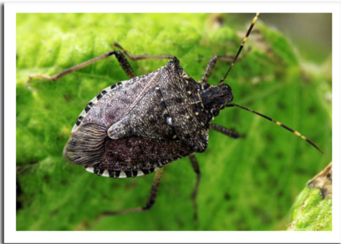
Brown marmorated stink bug

ted to calcium deficiency. As levels of this pest increase sharply in Wisconsin in coming years, on-site monitoring will be the best determinant of whether or not treatments targeting BMSB are necessary. DATCP encourages growers interested in trapping for BMSB to email DATCPDARMBulletin@wi.gov to be included in next season's monitoring program.