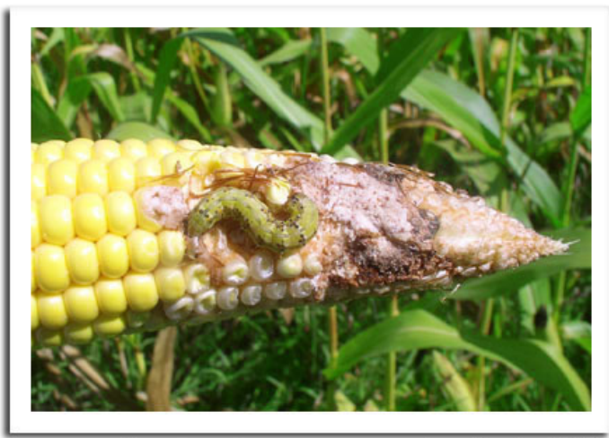
Corn earworm larva

Dam 348, Coon Valley 14, Cottage Grove 44, Hancock 15, Janesville 23, Madison north 64, Marshfield 1, Mayville 273, Ripon 101, Sun Prairie 108, Watertown 58, and Wausau 2.