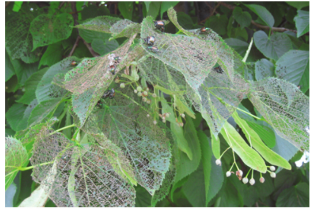
Japanese beetles feeding on linden leaves

JAPANESE BEETLE: Japanese beetle feeding and mating activity continues to be high on fruit trees, lindens, and ornamental plants at nursery growers in central and southern Wisconsin. Control of adult beetles is difficult. Insecticides may reduce beetle numbers and damage, but applications often need to be repeated every 3-4 days since new migrations of beetles can occur daily. Physically removing beetles or protecting valuable plants with floating row covers is the recommended control measure for small areas. Dropping the beetles into a container of soapy water will eliminate the aggregation pheromone released to attract more beetles.