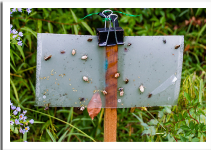
BMSB clear sticky panel trap

recent detection of BMSB near Montello is the first confirmed case for Marquette County and a new county record. Late-summer populations are likely increasing in areas of the state where BMSB is established, and it will be important for fruit and vegetable growers to remain alert for stink bug activity through October.