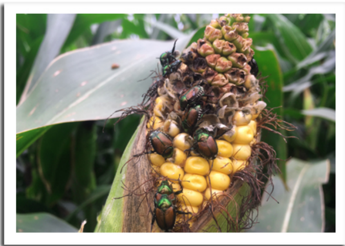
Japanese beetles feeding on corn

JAPANESE BEETLE: Adults are still numerous on corn silks in later-planted fields. A heavy infestation was encountered this week in the Ettrick area of Trempealeau County. As many as 16 beetles per ear were feeding on the silks of edge row plants, though most ears were infested with 3-5 beetles. The infestations extended 10 rows into the field. Beetle emergence has peaked and much of the threat to the state's corn and soybean crops has passed, but scouting should continue in fields where pollination is incomplete and silk feeding remains a concern. Japanese beetle activity is expected to diminish by early September.