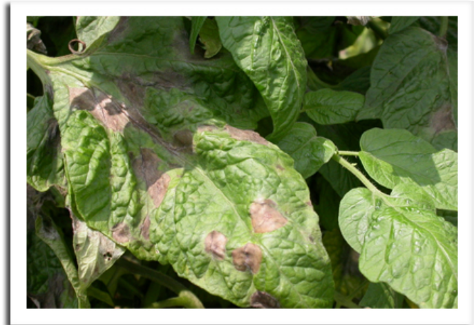
Late blight on tomato

gardeners, direct marketers and commercial producers who suspect late blight are encouraged to send symptomatic plant material to the UW Plant Disease Diagnostic Clinic: https://pddc.wisc.edu/sample-collection-and-submission/ . Late blight testing is free of charge.