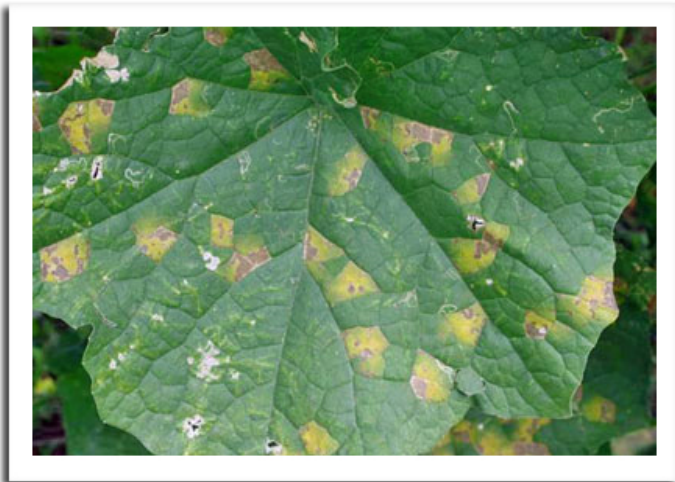
Cucurbit downy mildew angular lesions on cucumber www.planetnatural.com

Diagnostic Clinic. A map showing the current status of CDM in Wisconsin and the U.S. can be found at the CDM ipmPIPE forecasting site: http://cdm.ipmpipe.org/ .