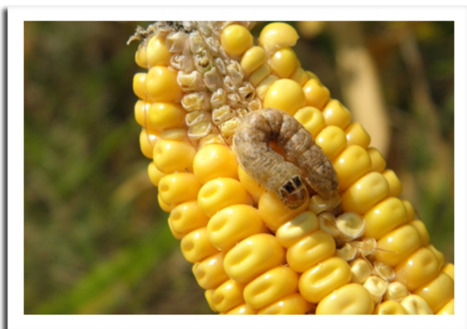
Western bean cutworm larva

last year, when 1,854 moths were collected in 70 traps (26 per trap average). The 2018 average count is also well below the 13-year survey average of 23 moths per trap and the second lowest since surveys began in 2005. Most larvae resulting from the flight are in the intermediate development stages and should enter the pre-pupal overwintering stage by early September. Monitoring network participants may remove their traps at this time.