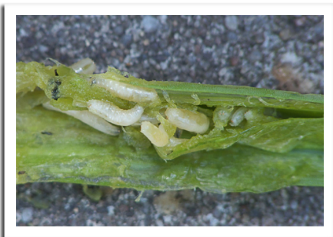
Onion maggots on leek stalk

ONION MAGGOT: Third-generation flies have begun emerging in southeastern and central Wisconsin. Larvae resulting from this final generation of the season will overwinter in cull onions or bulbs left behind in fields. Destruction of crop debris and removal of culls from the field or garden are basic cultural controls. Rotation to a non-host crop should also be considered in spring of 2019 for onion fields or plantings that had onion maggot problems this summer.