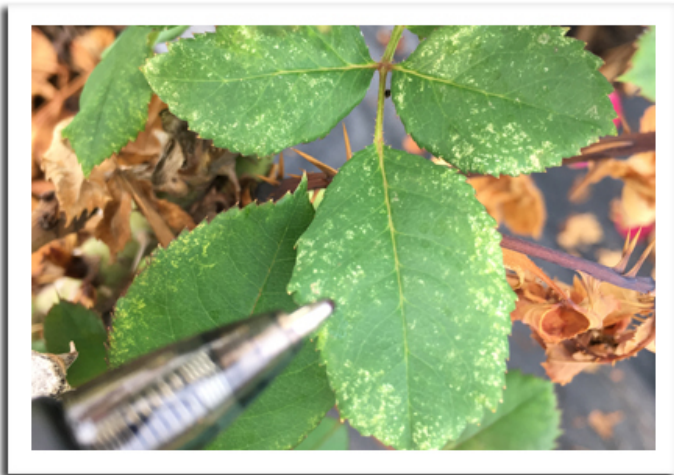
Spider mite damage on rose

SPIDER MITES: Nursery inspectors report considerable spider mite damage at several central Wisconsin growing locations, on a variety of plants such as daylily, rose, and other ornamentals and trees. Spider mite damage appears as stippling or speckling on leaves and may also include a fine webbing on the plant. Heavily infested plants turn completely yellow and stop growing. Although spider mites are difficult to observe without magnification, they can be detected by gently shaking infested foliage over a sheet of paper where they can be more easily seen against the white background.