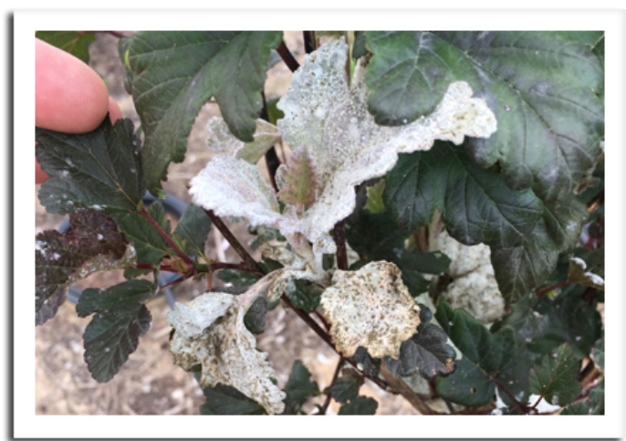
Powdery mildew on ninebark

POWDERY MILDEW: This fungal disease has been especially prevalent on Wisconsin nursery stock this season, with the extreme heat and humidity cycles being a major causal factor. Powdery mildew occurs on the upper and (less frequently) lower surfaces of leaves, as well as the stems, giving plants a white, powdery appearance.