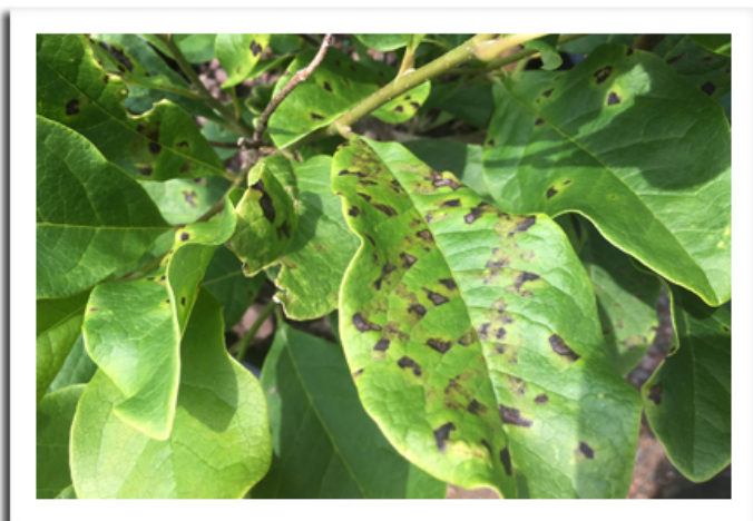
Magnolia infected with Pseudomonas

BACTERIAL LEAF SPOT: Nursery inspectors found bacterial leaf spot caused by Pseudomonas spp. on a variety of ornamental plants, including Magnolia X loebneri 'Leonard Messel', spirea, and viburnum. Pseudomonas spp. can be a year-round problem in nurseries and greenhouses when leaves remain wet due to overhead watering, splashing water, or plant crowding. Disease development is highly dependent on cool and wet conditions, therefore leaf spot occurrence can be limited by avoiding sprinkler irrigation, spacing plants properly, removing infected leaves early, and rotating susceptible plants away from areas where infected plants were grown. Pseudomonas bacteria are not controlled with fungicides. Sanitation is the most effective management practice.