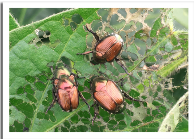
Japanese beetles feeding on soybean leaf Krista Hamilton DATCP

JAPANESE BEETLE: Defoliation has been observed in about 87% of the soybean fields examined during the aphid survey in August, indicating that Japanese beetle pressure is more prevalent than in recent years. Last season, 74% of surveyed fields had some degree of Japanese beetle feeding. Defoliation estimates were above the 20% threshold for reproductive soybeans in about 2% of the fields sampled this month, but the vast majority of sites had only low or moderate levels of leaf injury. As this year's high populations prove, Japanese beetle has become an increasingly significant threat to the state's agronomic crops. Although some beetles may persist into September, much of their activity should decline in another two weeks.