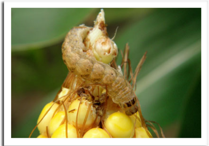
Western bean cutworm larva

and August were an accurate predictor of higher larval pressure in the field since infestations are relatively common in central Wisconsin, but also as far northwest as Barron County. Western bean cutworm larvae have been found at about 9% of the corn sites sampled this month.