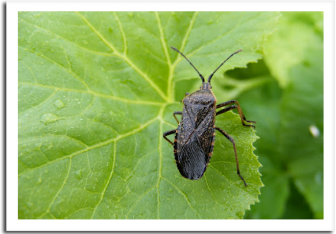
Squash bug adult

the garden gain importance and are critical for eliminating winter hibernation sites. Crop rotation is also suggested to reduce habitat for the overwintering adult population, which can survive the winter months under plant debris and cause damage to transplants and seedlings next spring.