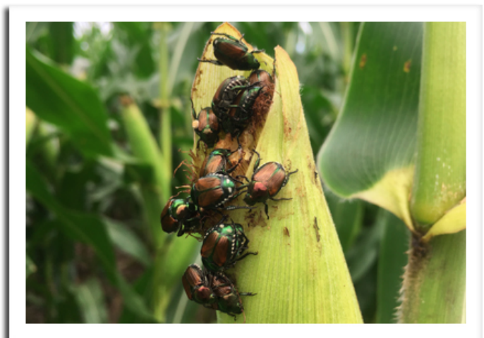
Japanese beetles feeding on corn silks

JAPANESE BEETLE: Adults are still numerous on corn silks in later-planted fields. Beetle emergence has peaked and much of the threat to the state's corn and soybean crops has passed, but scouting should continue in the eastern and northern areas, or in individual fields where pollination is incomplete and silk feeding remains a concern. Japanese beetle activity is expected to diminish by early September.