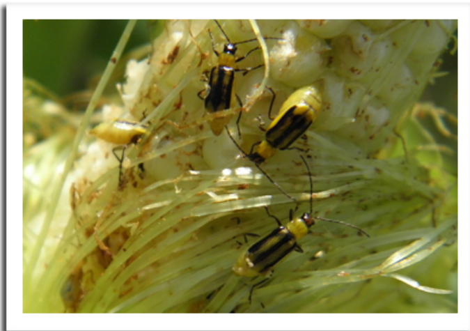
Western corn rootworm beetles Krista Hamilton DATCP

CORN ROOTWORM: The annual survey completed last week documented the lowest beetle counts since 1972. Average populations in all nine agricultural districts were well below the 0.75 beetle per plant level that indicates root injury potential next season, and the state average of 0.2 per plant is the lowest in recorded history of rootworm surveys in Wisconsin. Results of the survey are summarized in the CORN section.