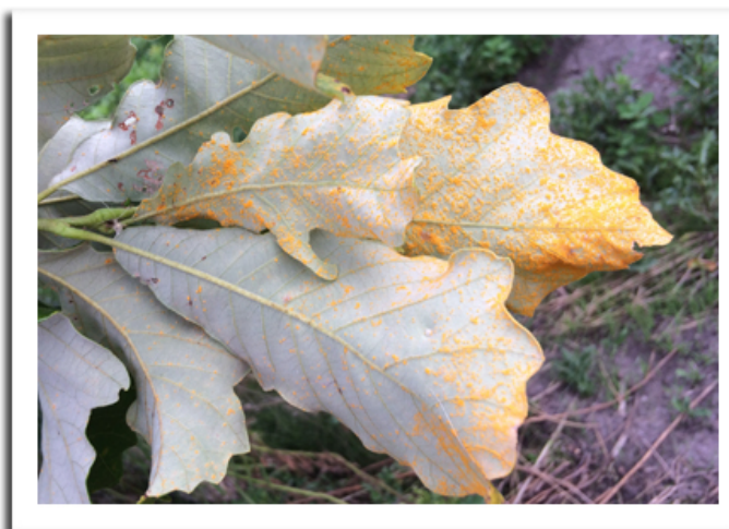
Oak rust on swamp white oak

PINE-OAK GALL RUST: A heavy rust infection was noted on swamp white oaks in Washington County this week. The conspicuous orange pustules that appear on leaf undersides in late summer and fall are diagnostic. Although the effects of this fungus are insignificant on oak, it can be devastating for the alternate host, pine, by causing the formation of oblong galls on the branches and trunks. The galls reduce branch growth, lead to branch death, and may kill young pine trees. Older, established pines may be disfigured, but the overall health is usually not affected. Pruning to remove galls or infected pine branches in late winter or early spring will reduce the amount of spores produced that will infect nearby pine and oak trees. No control measures are feasible or recommended on oak trees. In addition, pines should be inspected prior to purchase to ensure that they are free from galls.