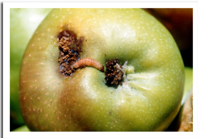
Codling moth larva and damage

CODLING MOTH: Moderate to extremely high counts were recorded in several orchard locations in the past week, confirming that significant codling moth flights are still occurring. Large captures of 24-77 moths per trap were reported from Racine and Grant counties. Pheromone trap checks may be discontinued once 1,700 degree days (modified base 50°F) have accumulated from the first biofix, at which time approximately 90% of second-flight adults will have emerged.