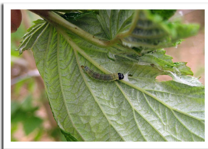
Obliquebanded leafroller larva

OBLIQUEBANDED LEAFROLLER: Orchardists are reminded to maintain pheromone traps for this insect throughout September. Second-generation larvae occasionally cause severe fruit damage late in the growing season and moth counts in fall can be a predictor of damage potential by first-brood larvae next spring.